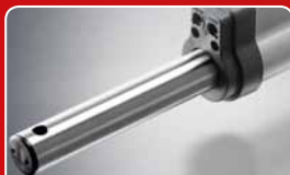
electronic limit switches with Reed contacts provide for a precise travel limitation

Last updated: 10/2013. Literal errors, errors and technical changes excepted.