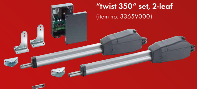
"twist 350" set, 2-leaf (item no. 3365V000)

incl. 1 swing gate operator, control board in housing, pluggable radio receiver (FM 868.8 MHz), post and gate wing bracket, 4-command transmitter (item no. 4020)