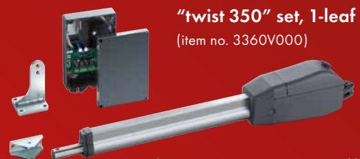
"twist 350" set, 1-leaf (item no. 3360V000)

incl. 1 swing gate operator, control board in housing, pluggable radio receiver (FM 868.8 MHz), post and gate wing bracket, 4-command transmitter (item no. 4020)