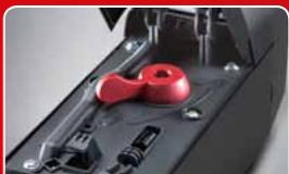
secure and convenient emergency release system