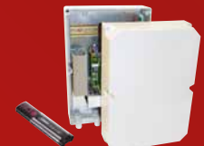
"twist XXL" control unit (item no. 3300V000)