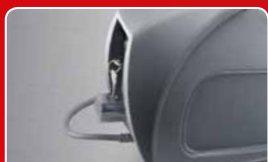
secure and convenient emergency release system