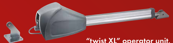
"twist XL" operator unit, 1-leaf (item no. 3280V000)