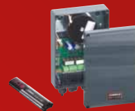
"twist XL" control unit (item no. 3282V000)